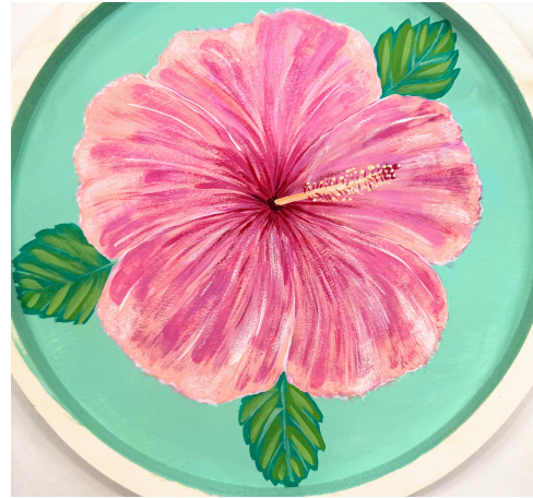
hand-drawn on wood- lots of streaking