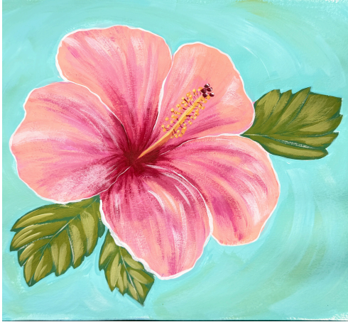
traced on paper - more conservative